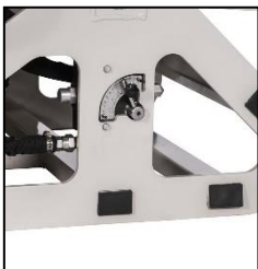
Speed controller feed roller