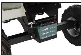
Battery for electric start