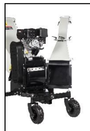
Folding feed and ejection hopper