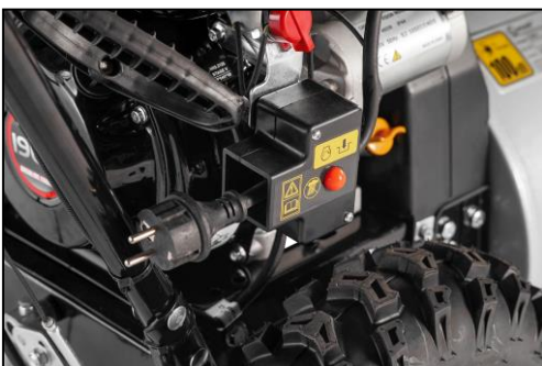
E-Start mittels 230V Stecker